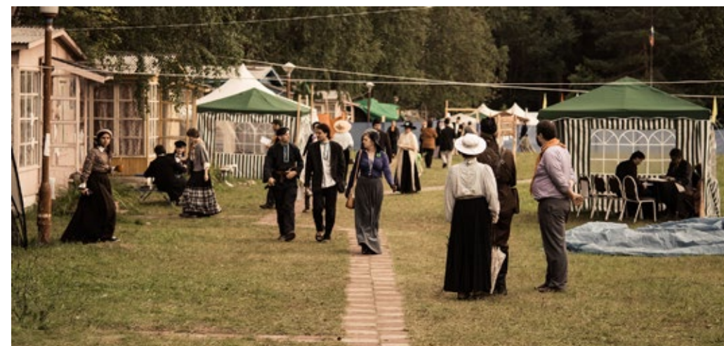
Embassy district in Saint Petersburg.

Many of the characters were based on actual historical persons. This includes all the noble and prosperous families that were portrayed, as well as known political leaders, poets and other prominent characters (Molodykh 2016). There was a long list of characters to choose from. The game masters would help players find a suitable role, discuss it with them and cast selected people on some roles. Women could, however, only take roles as men (which were a majority of the politically important roles) if agreeing to cross-dress with glued-on or painted moustaches, which a couple did. Even then, the most influential characters, such as the Tsar, were for men only. The same rule applied reversely to men, but few chose to cross-dress as women. Women who wanted to be involved in high politics could play members of the royal family or wives of important people. As Vorobyeva (2015) has noted: even though Russia has one of the most gender equal larp scenes in figures (54% men and 44% women, according to the International Larp Census 2014) there is a greater divide than in the Nordic scene when it comes to what kind of roles and play each gender has.